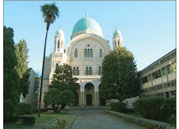
Florence Synagogue-Despite hardships, synagogues were built throughout Italy since the ancient days even before the time of Judas Maccabee. This one is still flourishing and was built between 1874-1882, following the emancipation and unification of Italy.

“ Judah Maccabee sent ambassadors to Rome in 161 BCE ”