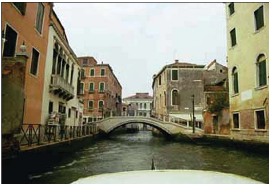
The first ghetto-Bridge over canal in Venice which led to the Jewish ghetto where three Jewish cultures came together and lived in high-rise buildings, the first of its kind. Conditions were so crowded that the only direction to build was up.

Italian Jews, then, have come a long way from the time of Judah the Maccabee, miraculously overcoming horrendous obstacles, but surviving and thriving in spite of everything. The miracle of Chanukah has many faces and one of them is the history of Italian Jewry.