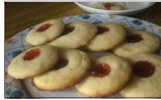
Whether you are making these at cheder as our kids have or at home, these are sure to please every palate, young or old.

This is a homemade version of Jamy Dodgers